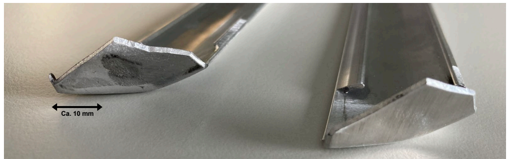
Profile with drawn edges before final machining