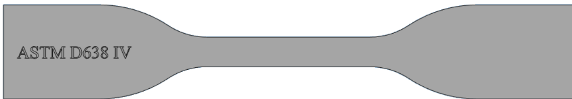
Figure 1 Tensile bar

25 tensile bars and 15 color cones were printed with the material and were kept under high intensity UV light for longer period. The parts were also exposed to periodic water sprays as described above. After the tensile bars were inside the UV oven for a stipulated time, the change in color as well as the mechanical properties like E modulus, Tensile strength and Elongation at break were measured. The tensile bars were used for mechanical testing and color cones were used to determine the color after Prolonged UV exposure.