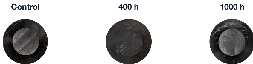
Effect of UV exposure on color of the specimens

After being exposed up to 1000 hours, no significant changes in color could be observed.