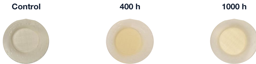
Effect of UV exposure on color of the specimens

After being exposed up to 1000 hours, there was a slightly yellowing change in color.