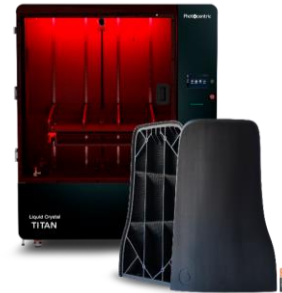
3D printed housing on Photocentric LC Titan with Ultracur3D® EPD 2006